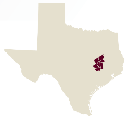
Brazos Valley, Texas

Texas A&M University (Texas A&M) creates a significant positive impact on the business community and generates a return on investment to its major stakeholder groups—students, taxpayers, and society. Using a two-pronged approach that involves an economic impact analysis and an investment analysis, this study calculates the benefits received by each of these groups. Results of the analysis reflect fiscal year (FY) 2021-22 (September 1, 2021, to August 31, 2022). An electronic version of the executive summary and fact sheet are available at economicimpact.tamu.edu .